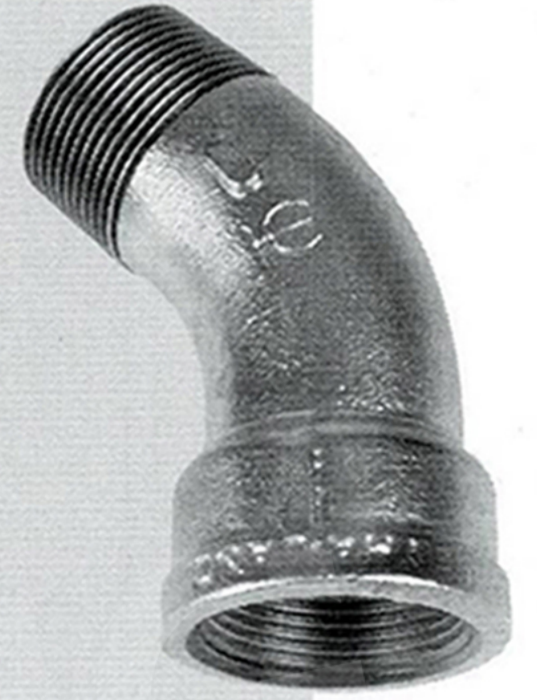
FIG.752 Long Sweep Bends, Banded, 45°, M&F (BE M/F 45°)